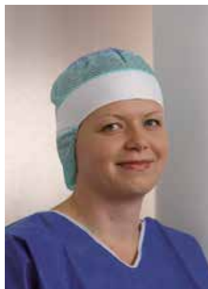
Surgical cap Tricolor

Size: Universal Violet Pack count: 6 x 50