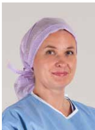
Surgical cap Julia, for long hair