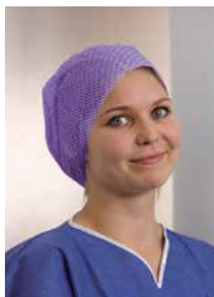
Surgical cap Kolumbus