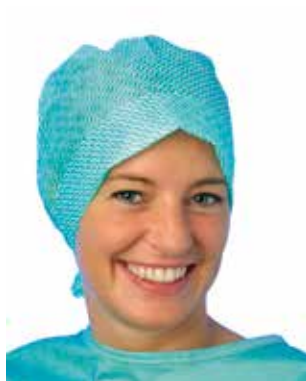
Surgical cap Lady