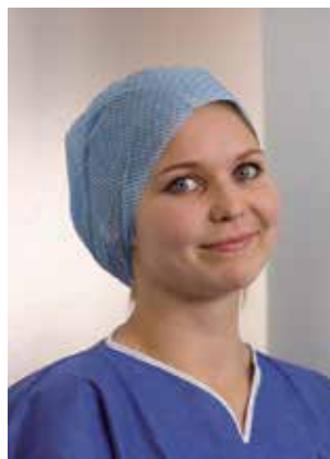
Surgical cap Kolumbus