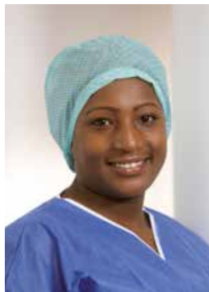
Surgical cap Kolumbus