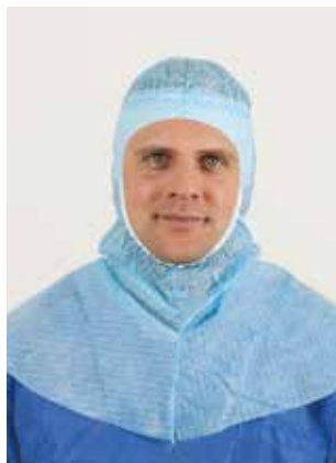
Surgical hood Valiant, shoulder protection